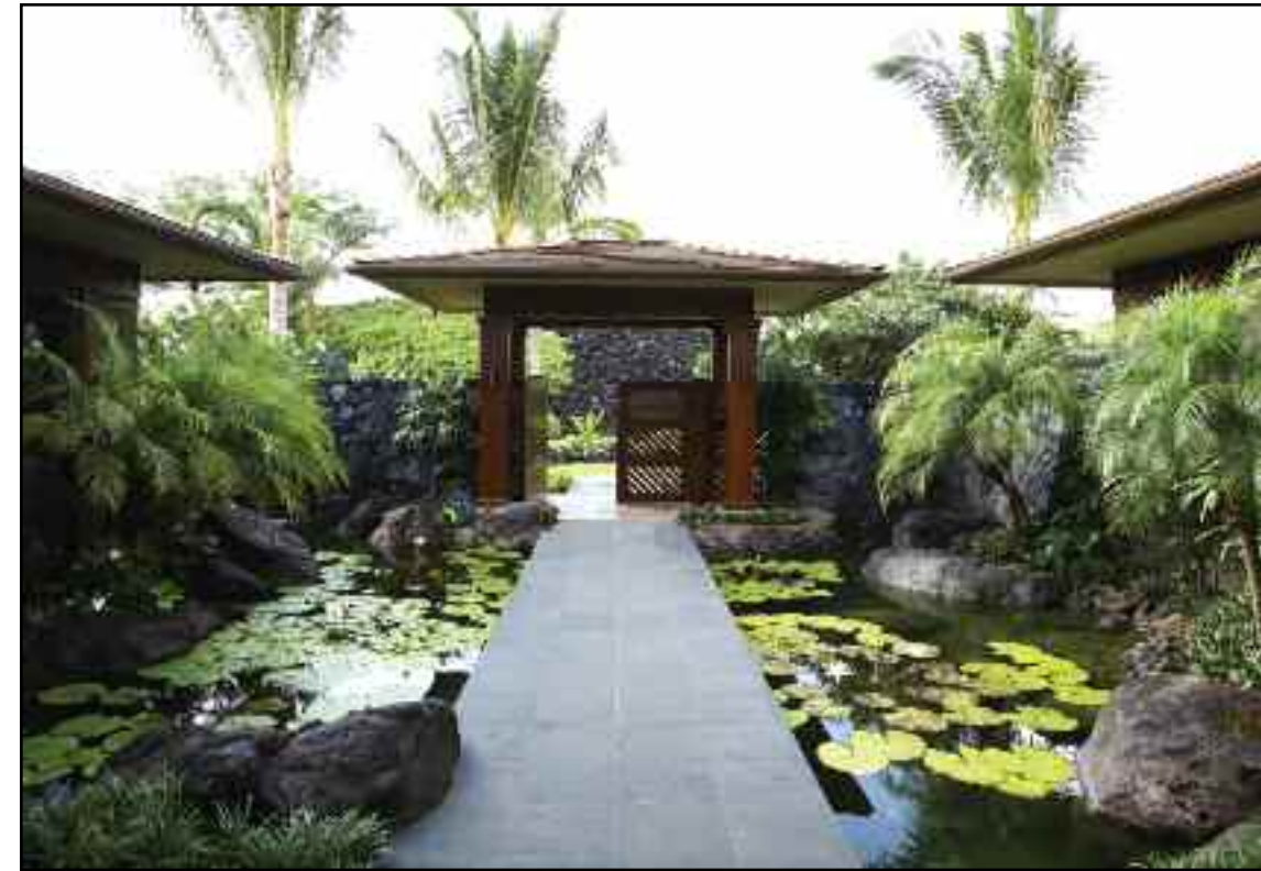
OPPOSITE: From the front, the unassuming house nestles into its surroundings while alluding to the elegance within and the views beyond.