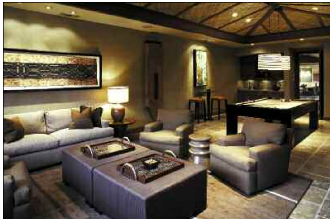
LEFT: A dream game room has an eight-foot pool table with a tan felt cloth. Cues are housed in custom cabinet made by Dovetail Gallery. A.Rudin sofa's and swivel's make the TV viewing area "divinely comfortable."