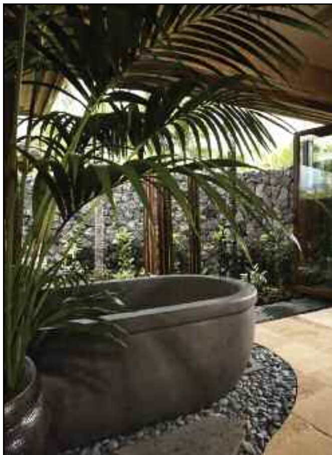
OPPOSITE FAR LEFT: A basalt tub sits in organic shaped bed of ili'ili rocks. Bi-fold doors open to outdoor showering courtyard with 'antique soil tiller's' landscape installation.