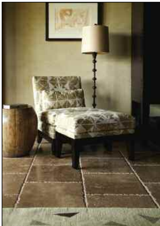
OPPOSITE LEFT: In a cozy sitting area of the master bedroom, a Madge Tennent original watercolor from 1954 hangs above a Ted Boerner chair and ottoman with Off White Castle Studios Nu'uaniu fabric.

The great room offers two sitting areas and features a Rosewood piano, textured wall coverings and a vaulted Lauhala ceiling, which inserts matting into the ceiling material. Pocket glass doors open from the great room to a lānai. The furniture's special fabric resists sun damage. An outdoor dining pavilion showcases rock carvings of Indonesian sandstone.