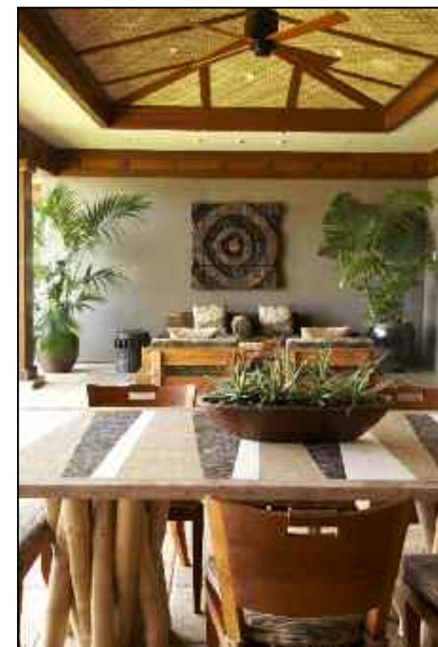
ABOVE: Hand glazed matte ceramic

and fabrics. For example, the wooden front gate’s decorative herringbone pattern is repeated throughout the residence. All doors, baseboards and molding are made of African teak, or Aframosa, wood.