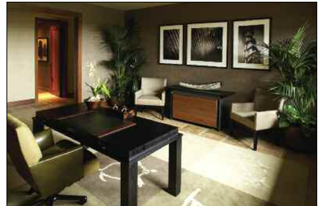
BELOW: Desk chair upholstered in combination of suede and leather awaits at the Wendell Castle desk. Katie Simmons Palm Triptych hang over a walnut, steel and slate credenza. The office also overlooks the rear courtyard and ocean.