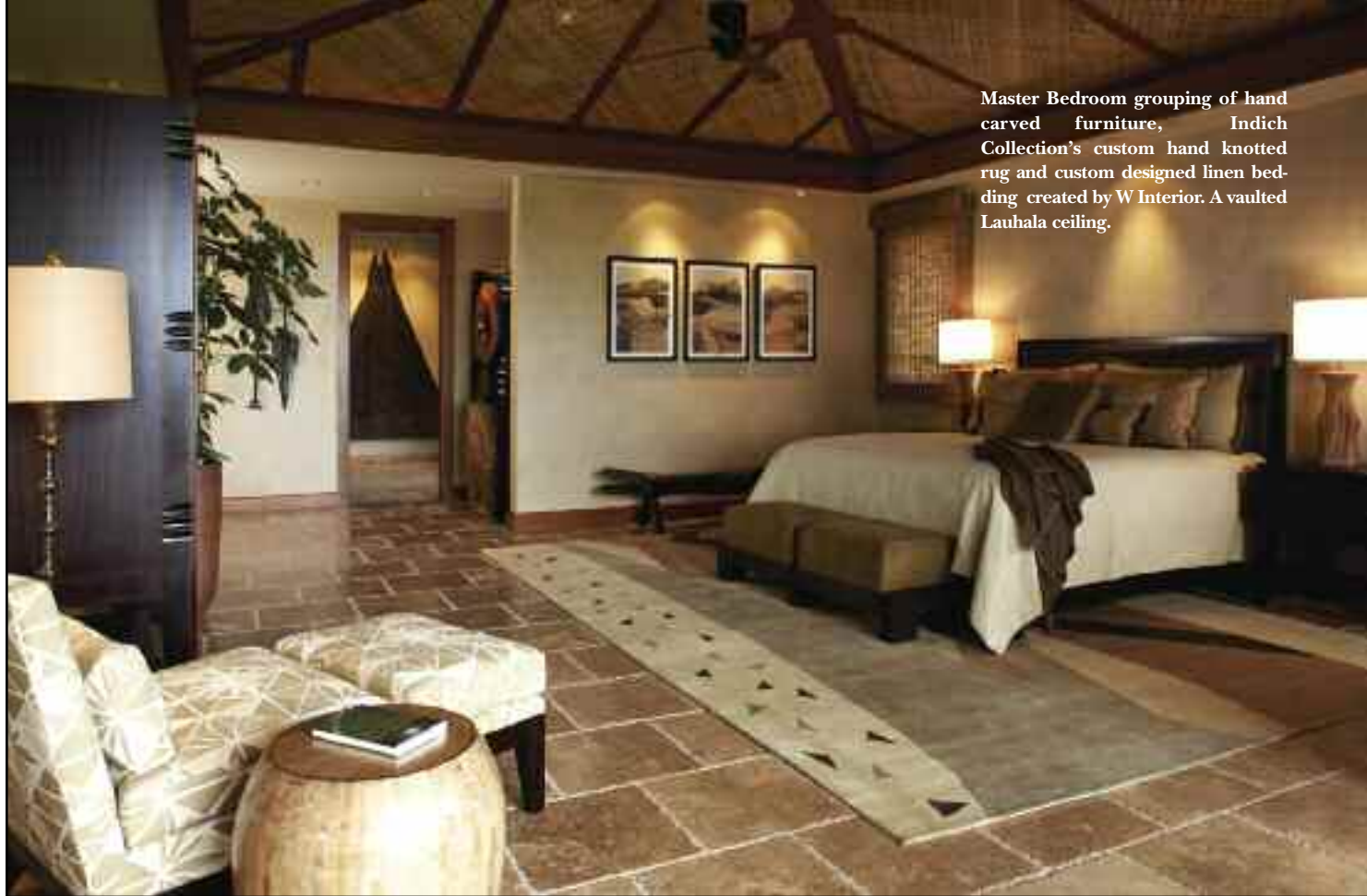
Master Bedroom grouping of hand carved furniture, Indich Collection's custom hand knotted rug and custom designed linen bedding created by W Interior. A vaulted Lauhala ceiling.