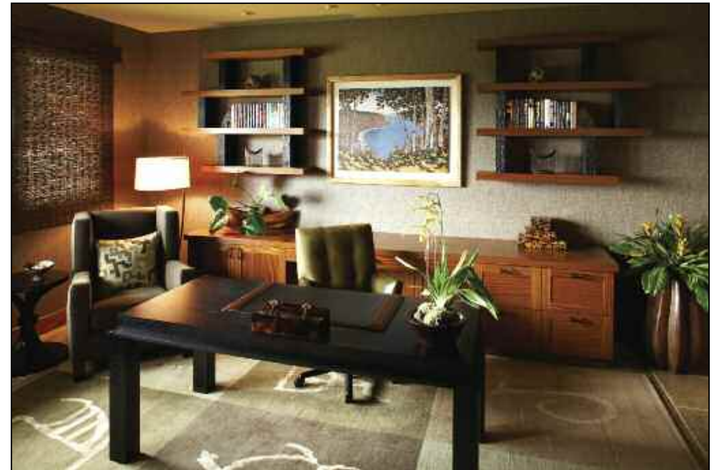
ABOVE: Tom Adolph's " Waipio Valley" hangs above an Aframosa workstation with floating chiseled shelves. Indich Collection fabricated the custom rug which reflect Petroglyph's reflecting Kukio's leisurely pursuits.